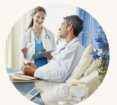
patient after surgery

First Layer: Soft Non Woven Fabric which covers the absorbent filler and prevent the filler from reaching the skin or clothes under normal handling